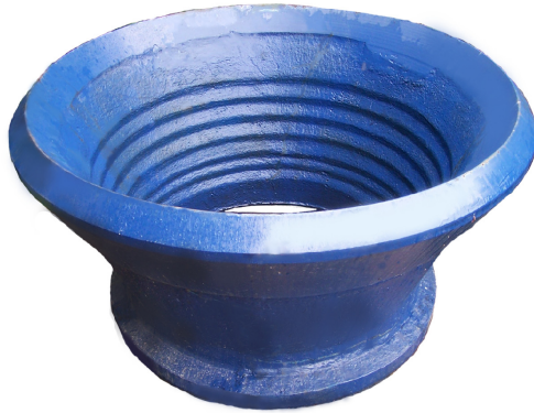
XL50132077 Mantle HP300 Price: $2000.00