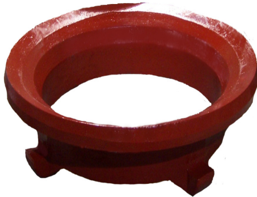
B272808C Lower Mantle Telesmith 48C Price: $1451.00