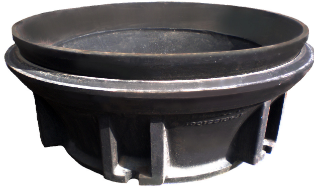
1 AC 500 – Mantle P/N 17302598001 & Liner 17401831001 Price: $7300.00/set