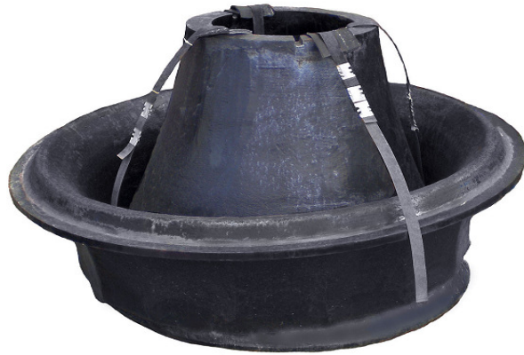
1 36" Traylor – Mantle P/N 7375F & Liner 7422F Price: $5400.00/set