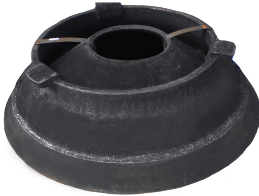
3 1000 Pegson – Mantle P/N 6039106 & Liner 6039052 Price: $3550.00/set