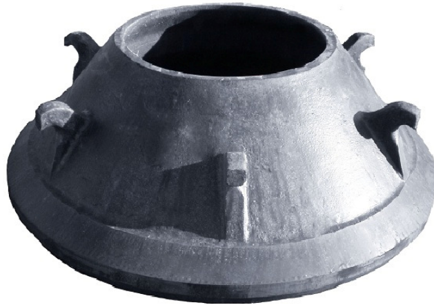
4 1/4 Symons - Rimtec SCRIM48302800 – Medium Fine Liner Price: $3000.00