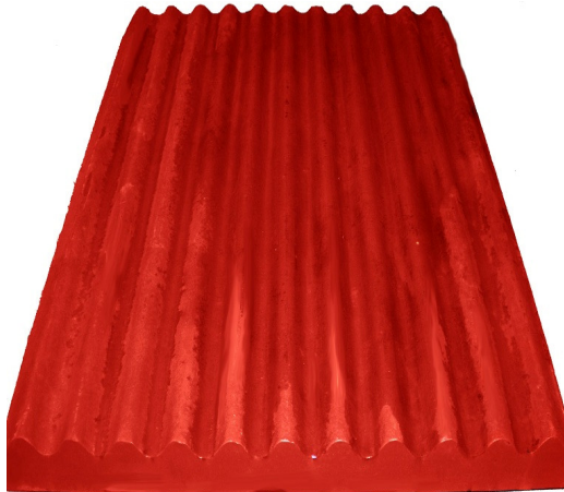
C-12 Extec - Foothills FSJ470000 - Stationary Jaw Price: Please Call